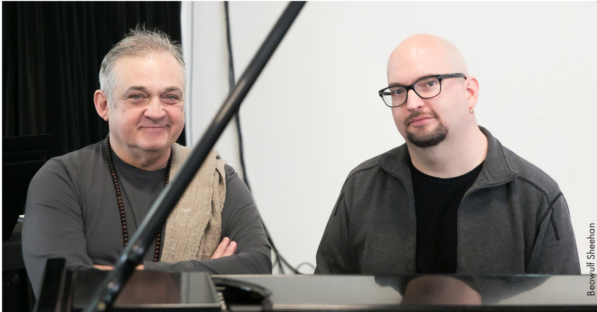
Mark Morris & Ethan Iverson