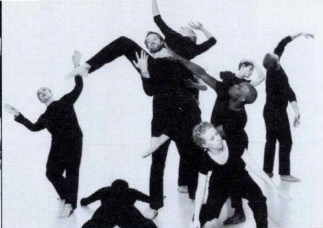
Sang-Froid . Mark Morris Dance Group