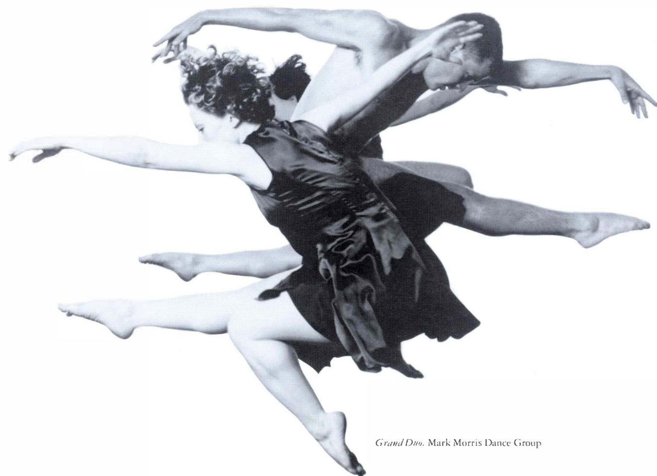
Grand Duo . Mark Morris Dance Group

Over the last 20 years, Mr. Morris's work has evolved into a distinct style all his own, which will continue to provide endless joy for audiences all over the world.