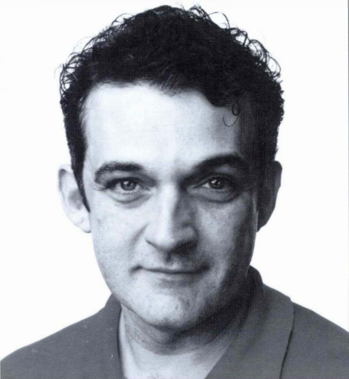
Mark Morris, Choreographer