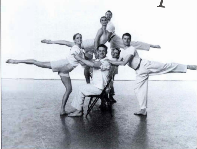
Dancing Honeymoon , Mark Morris Dance Group

Prodigiously talented, always fascinating and provocative creator and artistic presence