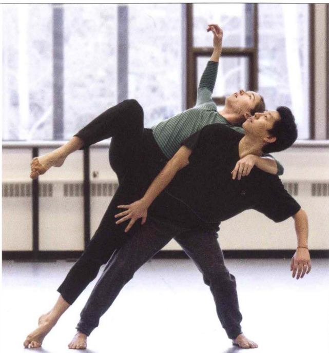
Peggy Baker Studio, photo courtesy of Banff Centre.