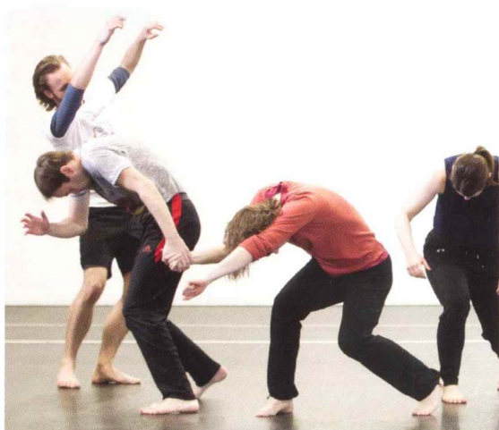
Mark Morris Dance Group company members rehearse Pepperland

Dance companies often rely on support from foundations and individual donors to fund new works, and only after the premiere convince presenters to schedule performances. Mark Morris Dance Group, however, has developed a model that is unusual in the dance world, whereby multiple arts institutions join together to commission a piece—often years before it will reach their stages.