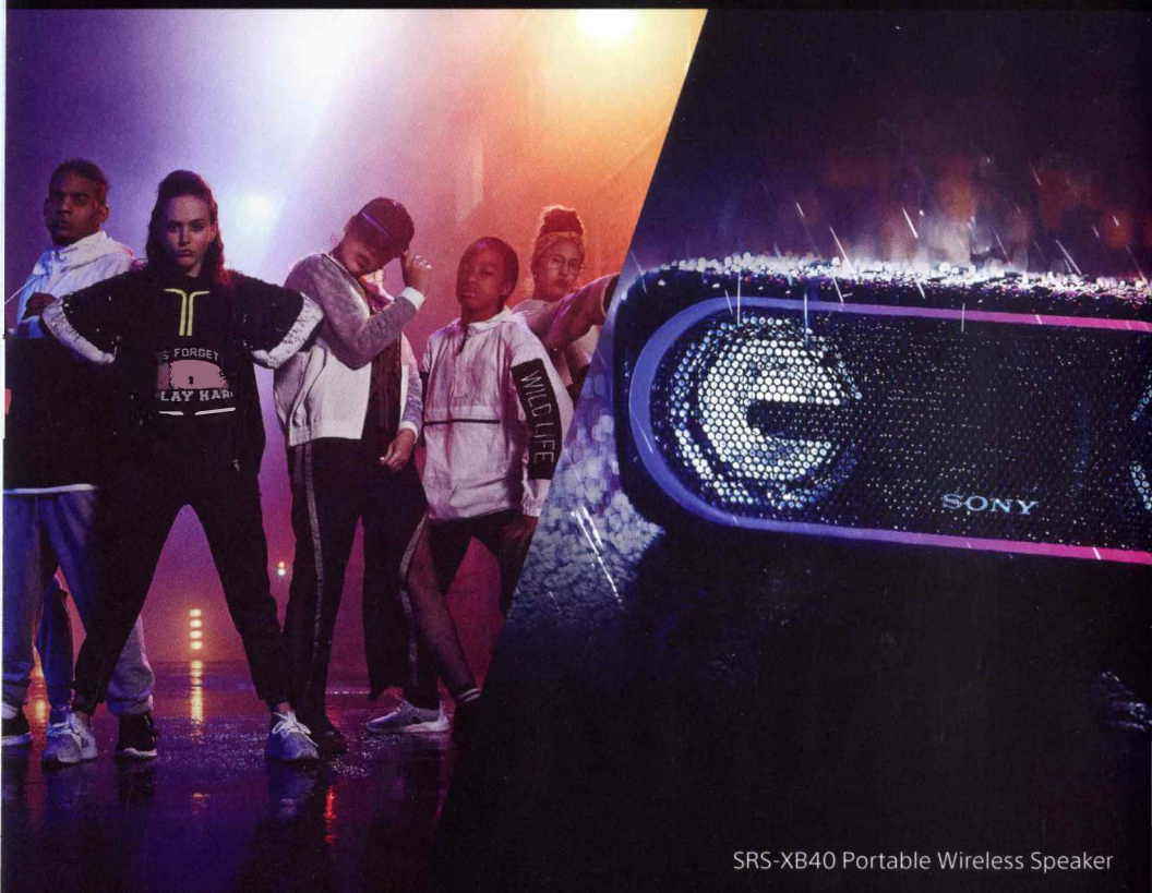
SRS-XB40 Portable Wireless Speaker