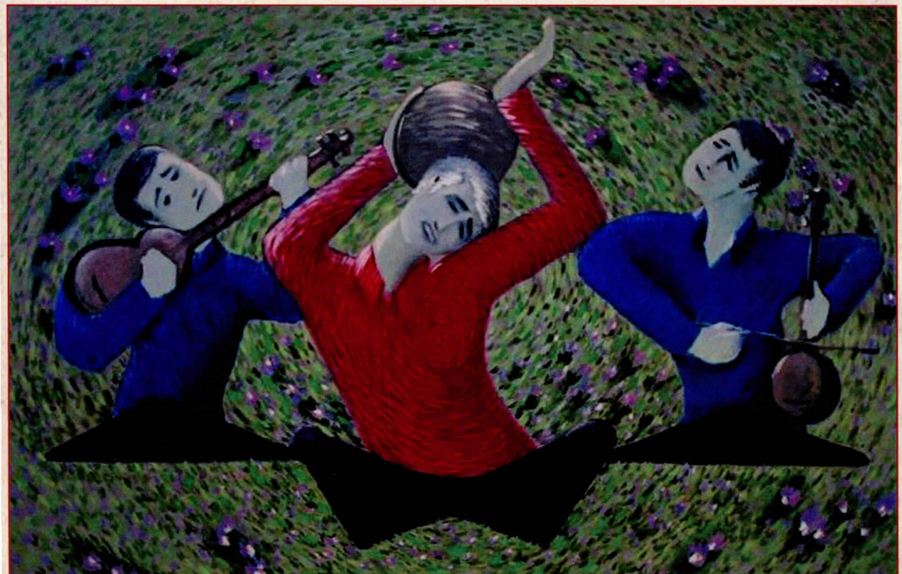
Mugham Trio (2006) by Sanan Samadov.