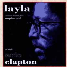
The song Layla was written by Eric Clapton and Jim Gordon and originally released by their blues rock band Derek and the Dominos. Clapton was inspired to write the song after reading a copy of Nezami Ganjawi's Layla and Majnun , as well as by his then unrequited love for Pattie Boyd, the wife of his friend and fellow musician George Harrison of The Beatles.