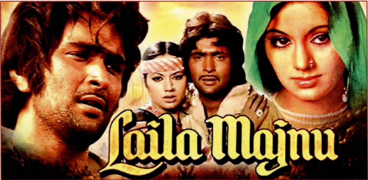
Laila Majnu, a 1976 Hindi movie based on the story of Layla and Majnun, was directed by Harnam Singh Rawail (H.S. Rawail) and stars Rishi Kapoor, Ranjeeta, Danny Denzongpa, Aruna Irani, Asrani, Iftekhar, Tom Alter and Ranjeet. The film's music is by Madan Mohan and Jaidev.