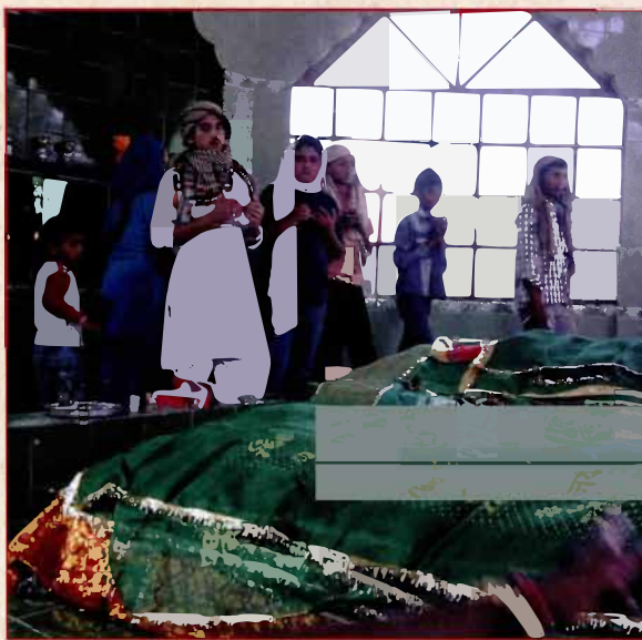
Laila Majnu Ki Mazar or Mausoleum of Layla and Majnun is situated near Anupgarh, a town and municipality in Sri Ganganagar District in the state of Rajasthan, India. According to the local legend, the famous lovers Layla and Majnun died here. A fair held in June is attended by hundreds of newlyweds and lovers.