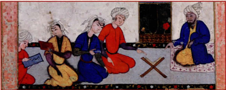
Layla and Qays (Majnun) at School. Manuscript W.608, Walters Art Museum. 971 AH/1563 AD (some repainting 13th century AH/19th century AD). Ink and pigments on laid paper.