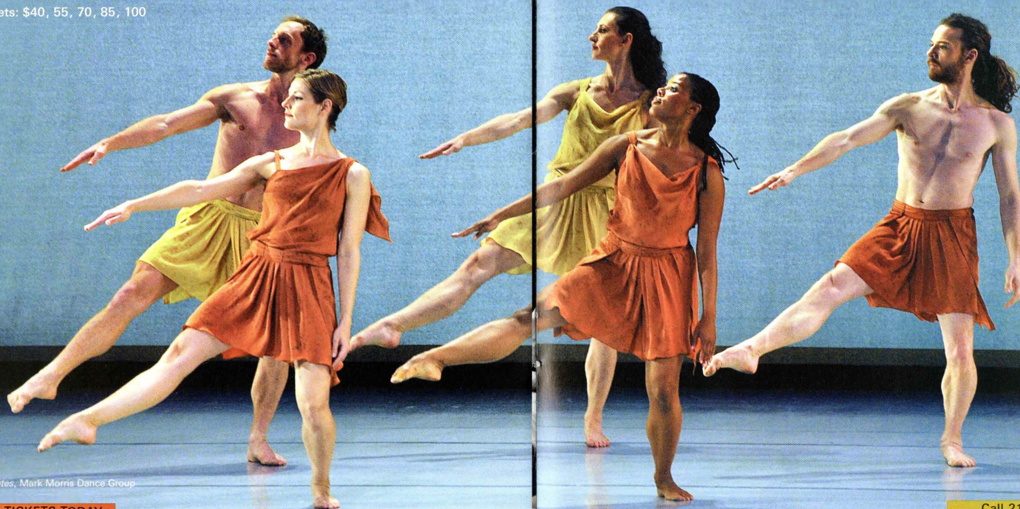
Socrates , Mark Morris Dance Group