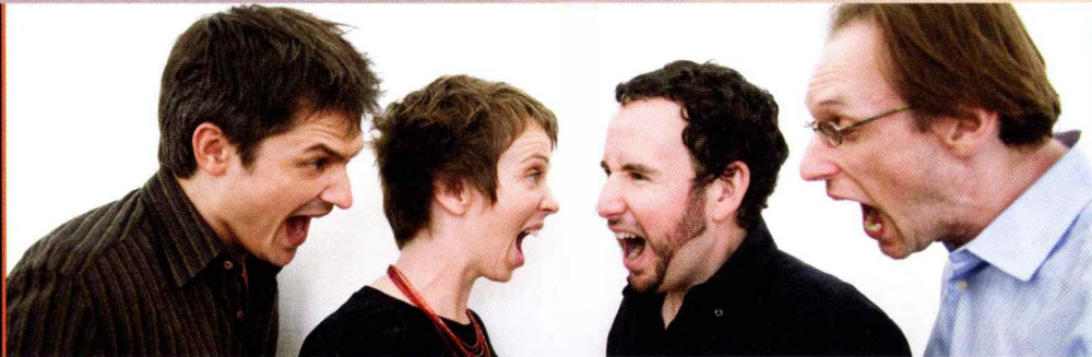
International Contemporary Ensemble