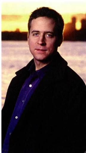
May 17, 19 Chamber Music Society