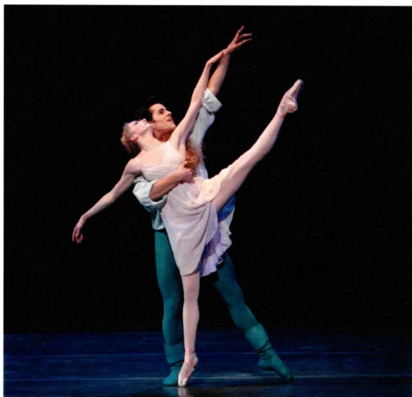
May 15-17, 19-21 New York City Ballet Presents: Romeo + Juliet