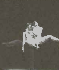
Nederlands Dans Theater 2