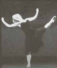
Mark Morris Dance Group