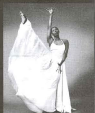
Alvin Ailey American Dance Theater