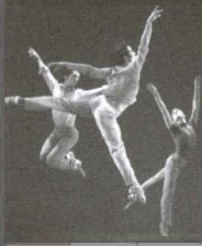
Lar Lubovitch Dance Company