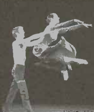
Hubbard Street Dance Chicago