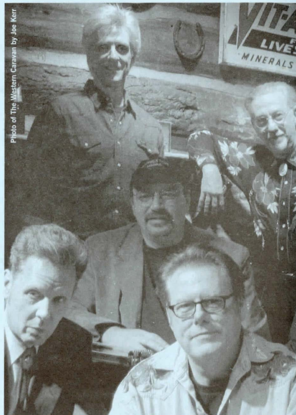
Photo of The Western Caravan

The Western Caravan, New York's premier western swing orchestra, has been serving up classic country, western swing, and honky-tonk standards as well as their own lively originals since 1995. Its rollicking performance at BAMcafé will feature fiddle, vocals, steel guitar, trumpet, and piano, and will include some of the music they will be playing with Mark Morris Dance Group later in March.