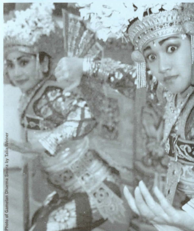
Photo of Gamelan Dharma Swara

Gamelan Dharma Swara is a New York-based ensemble dedicated to traditional and new works for the arresting bronze percussion instruments of Bali. Tonight's Dharma Swara performance features one of the very few gamelan semara dana, a rare seven-tone Balinese ensemble. Haunting, endangered classic melodies share the bill with daringly modal new compositions by pioneering young Balinese musicians.