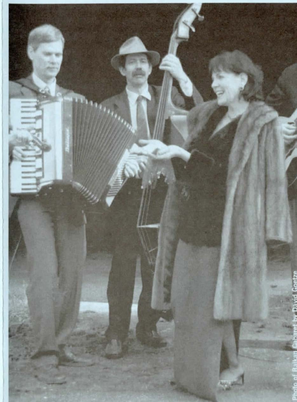
Photo of Balkan Cabaret

The MMDG Ensemble returns for another evening of resplendent music including Gershwin's Three Preludes for Piano , Cowell's String Quartets, Wilson's A Spell along with Dancing Honeymoon and other works from its repertoire.