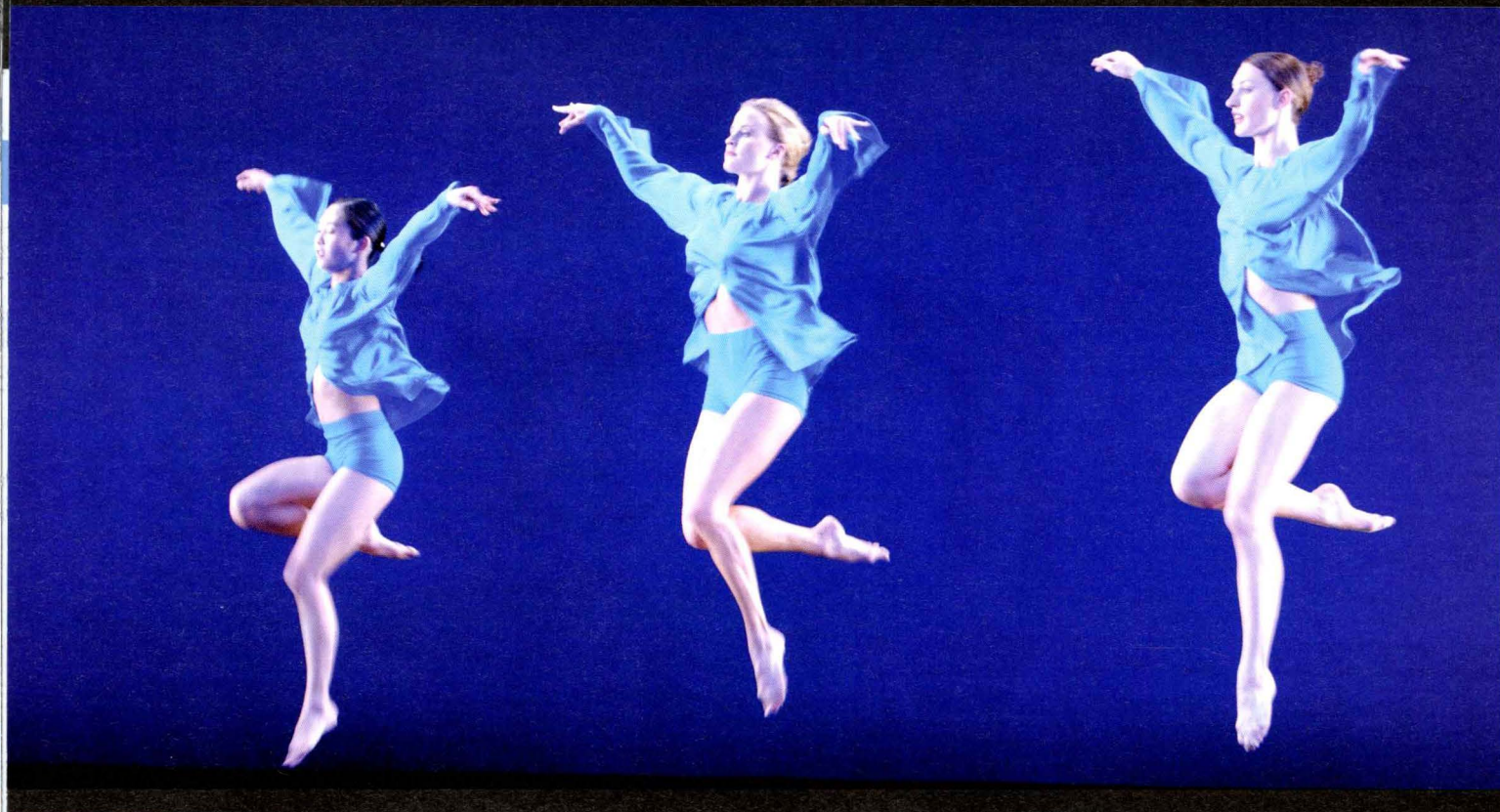
above MMDG Ensemble Dancers