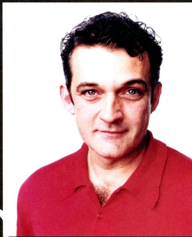
left to right MMDG Ensemble Dancers, Mark Morris