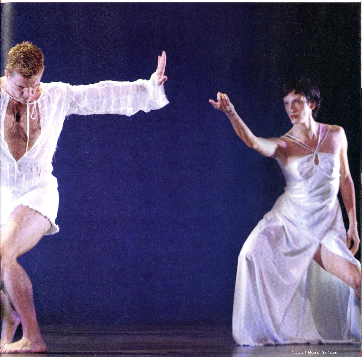
I Don't Want to Love

That is enough to make him...a symbol of his times." — The New Yorker