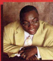
Cyrus Chestnut Jazz Revelation