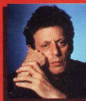
NJSO Premieres Philip Glass