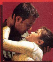
The Making of Miss Saigon