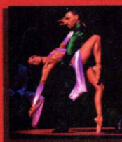
Dance Theatre of Harlem's St. Louis Woman