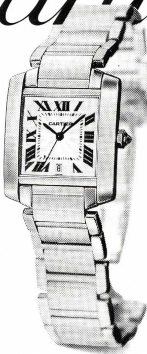
Tank® Française* Watch (Large) Steel. $2,700. 18K gold and steel. $4,200. 18K gold. $18,500.

©1996 Cartier, Inc. *Design Patent Pending