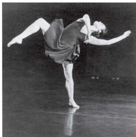
Mark Morris Dance Group