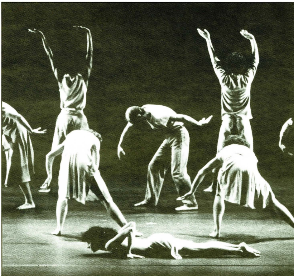
Mark Morris Dance Group