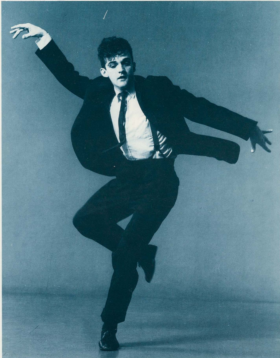
Mark Morris Dance Group