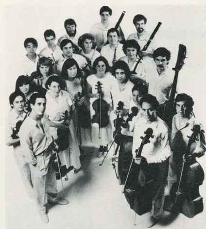
Orpheus Chamber Orchestra